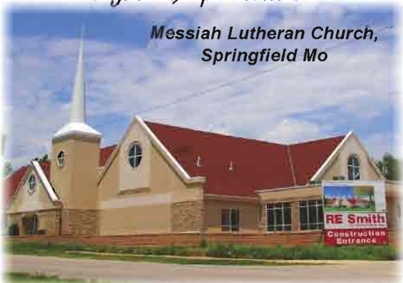
Messiah Lutheran Church, Springfield Mo