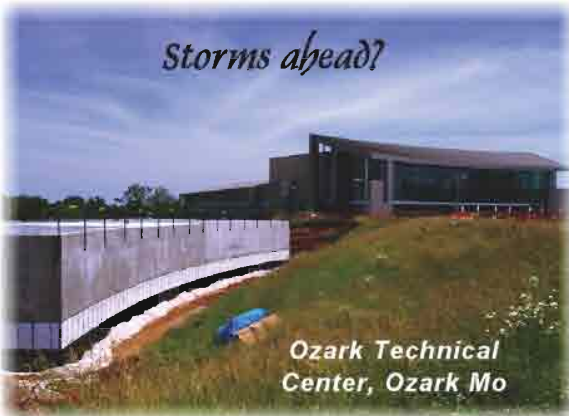
Ozark Technical Center, Ozark Mo