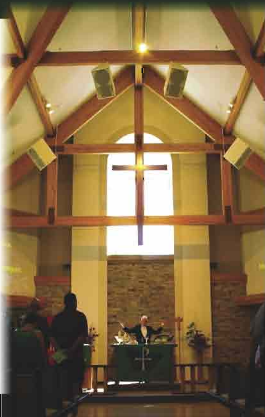
First Service in new building June 21, 2009

Imagine...is what congregants of Messiah Evangelical Lutheran Church of Springfield were asked to do by Kairos Consultants six years ago when they began a building program.