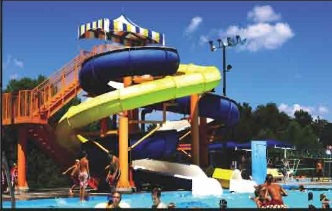
Walton Aquatic Center, Nevada, Missouri

PRSR STD U.S. POSTAGE PAID JOPLIN, MO 64802 PERMIT NO. 111