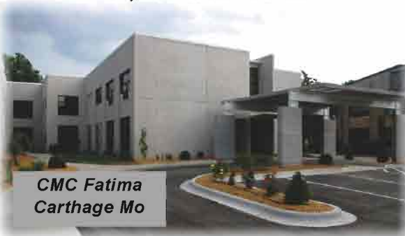
CMC Fatima Carthage Mo