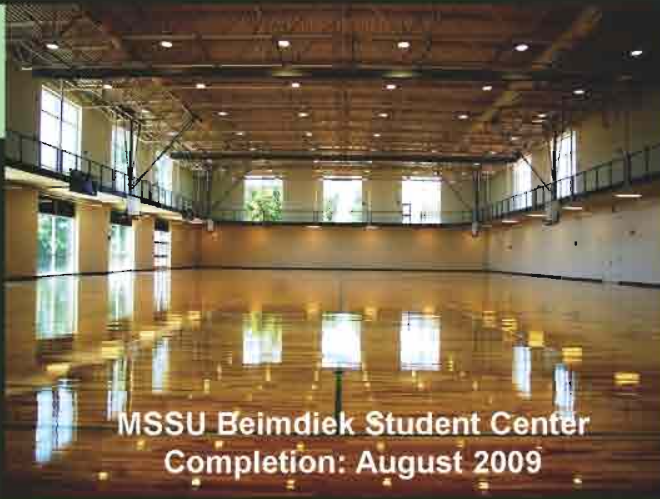
MSSU Beimdiek Student Center Completion: August 2009

Springfield: 311 South Union Springfield, Mo 65802 417-831-2536