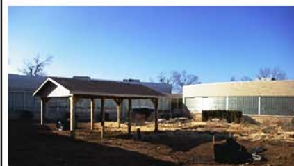
Eastmoreland School connecting corridor

RE Smith Construction **1036 West 2nd Street Joplin, MO 64801-0549 ** 417-623-4545