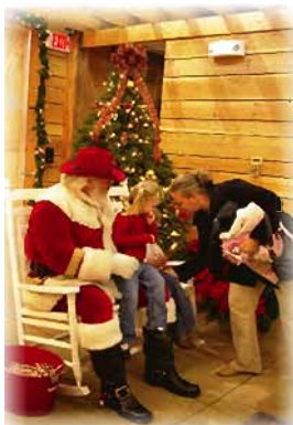
Area children enjoy "Christmas at the Farm"