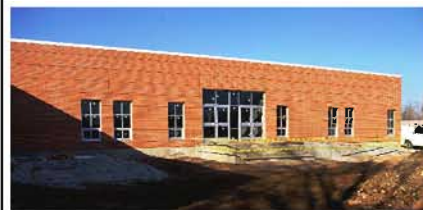
McKinley School addition, new entrance