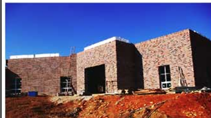
Stapleton School addition, new entrance