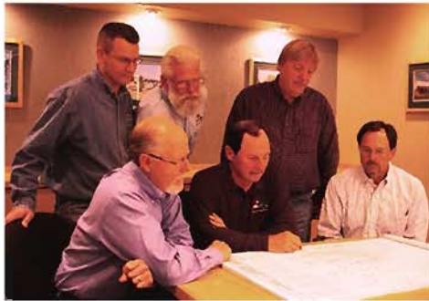
The RE Smith team studies a Design/Build Project

"The entire building process is much faster with a single source for designing and building.