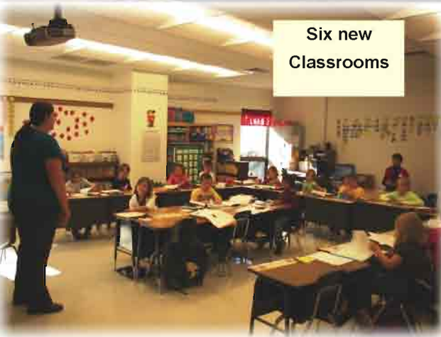
Six new Classrooms