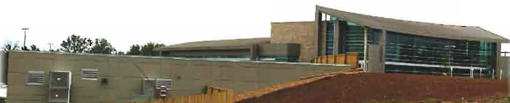
FEMA Shelter for Ozark Technical College, Richwood Valley Campus, Christian County