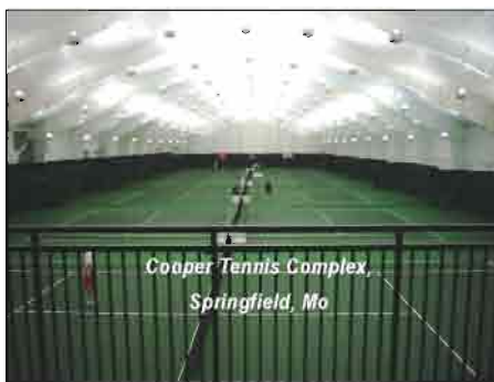
Cooper Tennis Complex, Springfield, Mo

An RE Smith Construction metal building system offers significant cost and performance advantages for business and manufacturing, non-profit organizations, and educational institutions when compared to conventional construction methods.