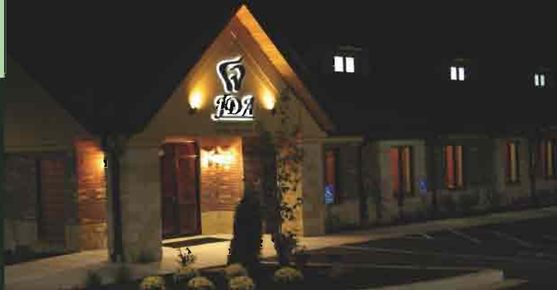
Joplin Dental Arts 510 West 32nd, Joplin, MO

311 South Union Springfield, Mo 65802 417-831-2536