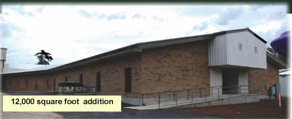
12,000 square foot addition