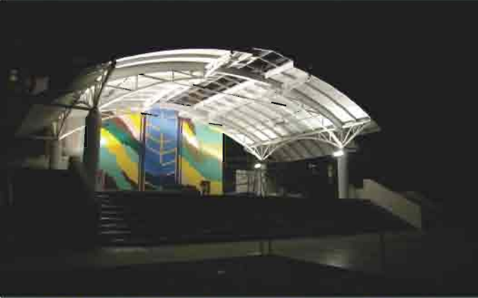
CMC Stage for Marian Days 2009, Carthage, Missouri

Presort Std. U.S.POSTAGE PAID Joplin, MO 64802 Permit No. 116