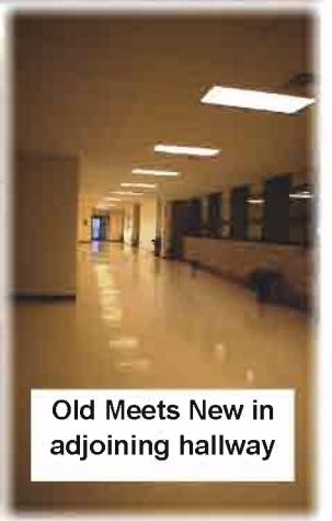
Old Meets New in adjoining hallway