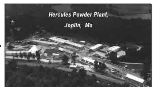
Hercules Powder Plant, Joplin, Mo

RE Smith pioneered pre-engineered buildings in the Ozark Region during the 1960s, and has built over 5,000,000 square feet of metal pre-engineered buildings in the Ozarks region since that time.